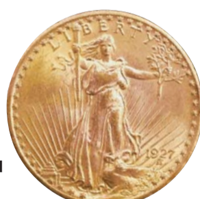
Pictured are examples of the jewelry, coins and paper money Gemco is looking to buy. Gemco would like to wish everyone a very Merry Christmas.

call. Hours are Tuesday through Friday, 10:30 a.m. to 5 p.m.; and Saturday, 10:30 a.m. to 4 p.m. Call (614) 878-2646.