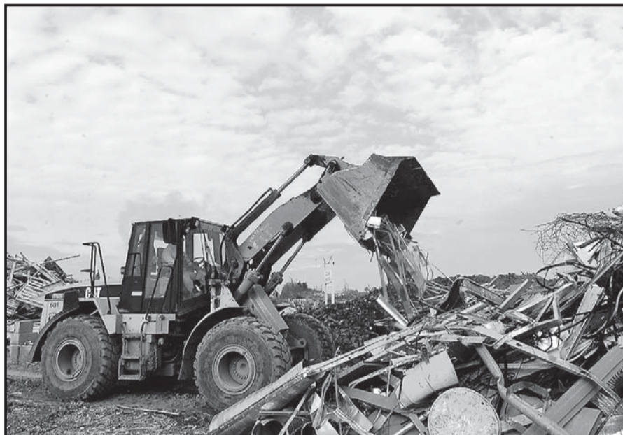
Frank Road Recycling Solutions strives to keep the environment clean by diverting materials from the landfill and by adhering to EPA guidelines.

Frank Road Recycling Solutions strives to keep the environment clean by diverting materials from the landfill and by adhering to EPA guidelines. "We want to be a good neighbor," Loewendick adds. In fact, the company recently